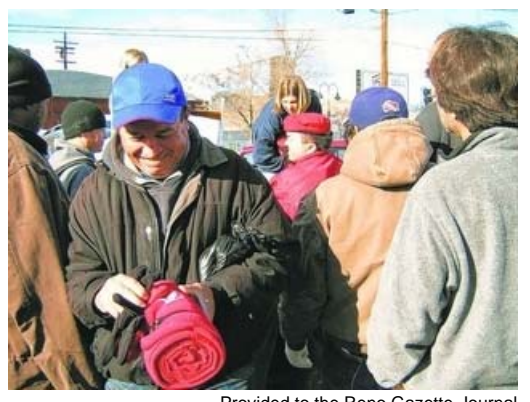
People in need of blankets, gloves and hats received them Tuesday from the Guardian Angels at the St. Vincent Center on Fourth Street.